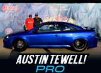
AUSTIN TEWELL! PRO