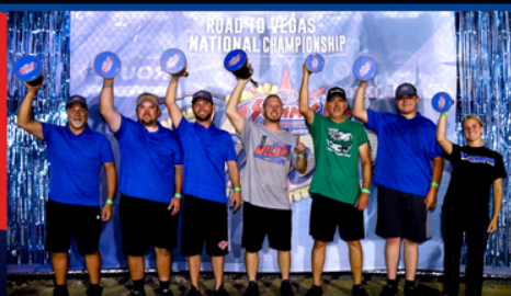
2024 NHRA DIVISION 3 CLASS CHAMPIONS

SUPER PRO, PRO, SPORTSMAN & S/P BIKE Division Champions earn a WALLY! Champion's Jacket! Champion's Gold Ring! NHRA Gold Card!