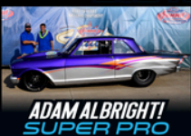
ADAM ALBRIGHT! SUPER PRO