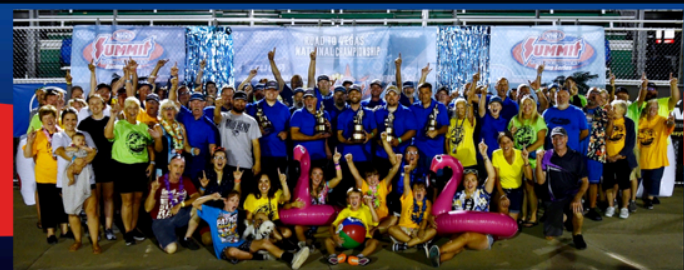
2024 TEAM CHAMPIONS - SUMMIT MOTORSPORTS PARK

BONUS RACES, SPECIAL AWARDS, EVENT SCHEDULE & MORE ON PAGE 2! |||